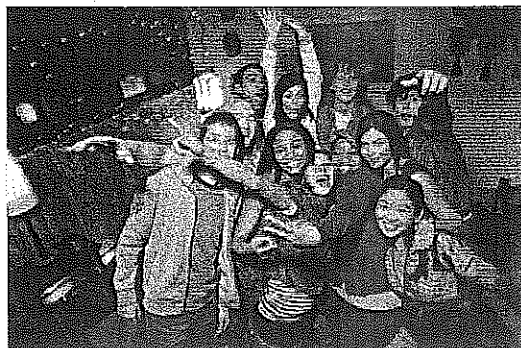
"Best concert ever!"

3. Look at the possible captions for this photo in the chart below. Circle the captions that make this photo okay to post, and mark an "X" over the captions that would make this photo inappropriate to post.